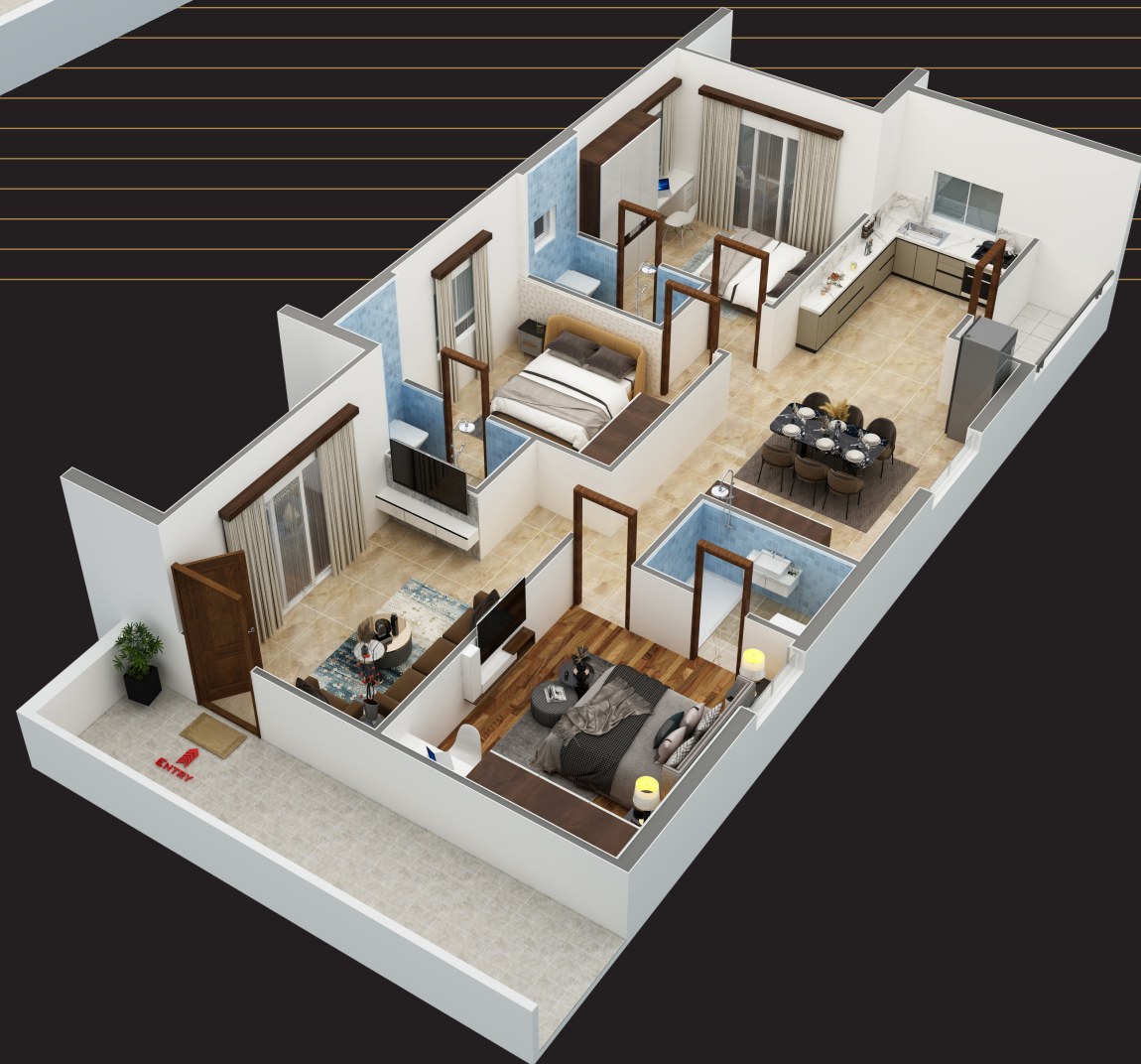
WEST VIEW 3 BHK