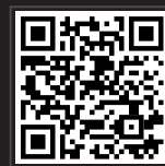
Scan QR Code for Direct Location