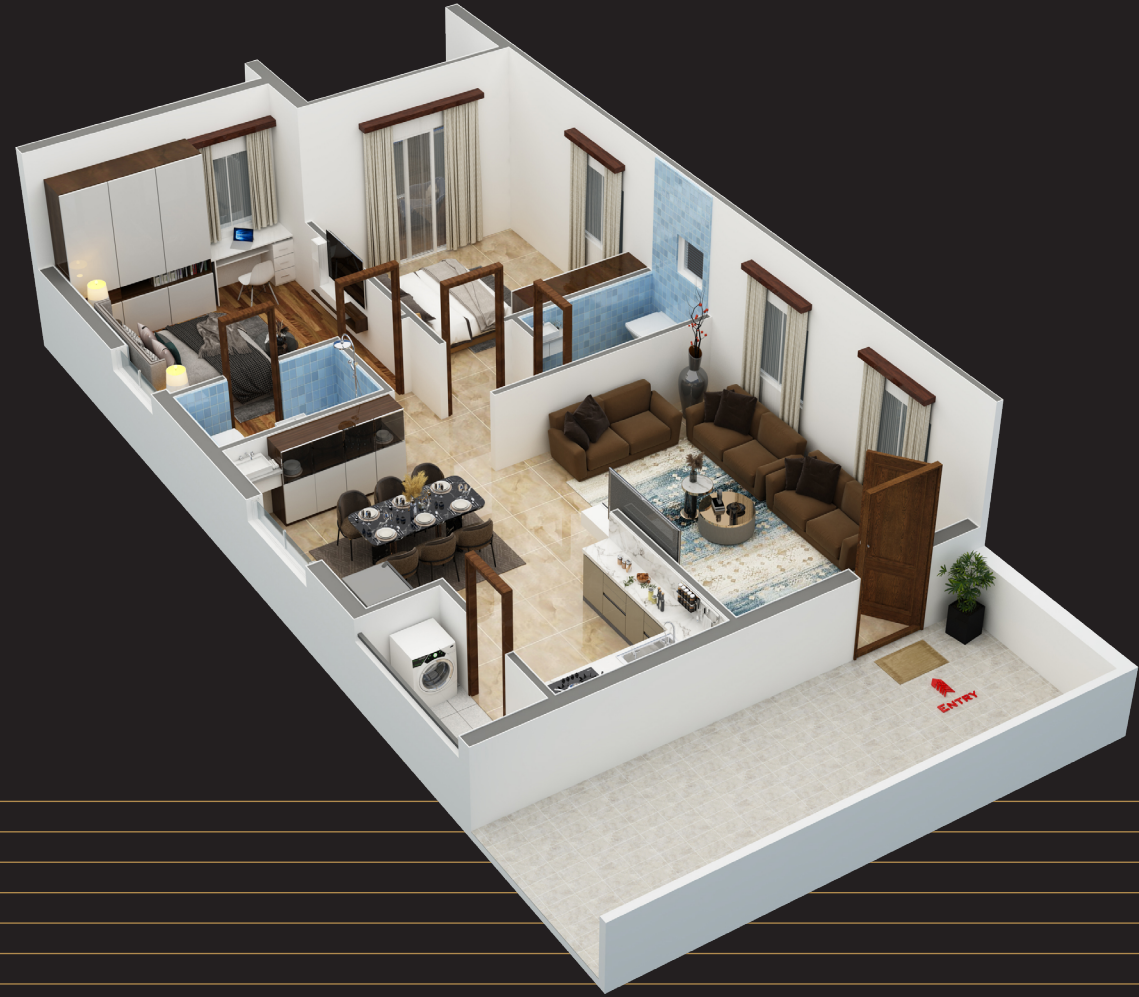
EAST VIEW 2 BHK