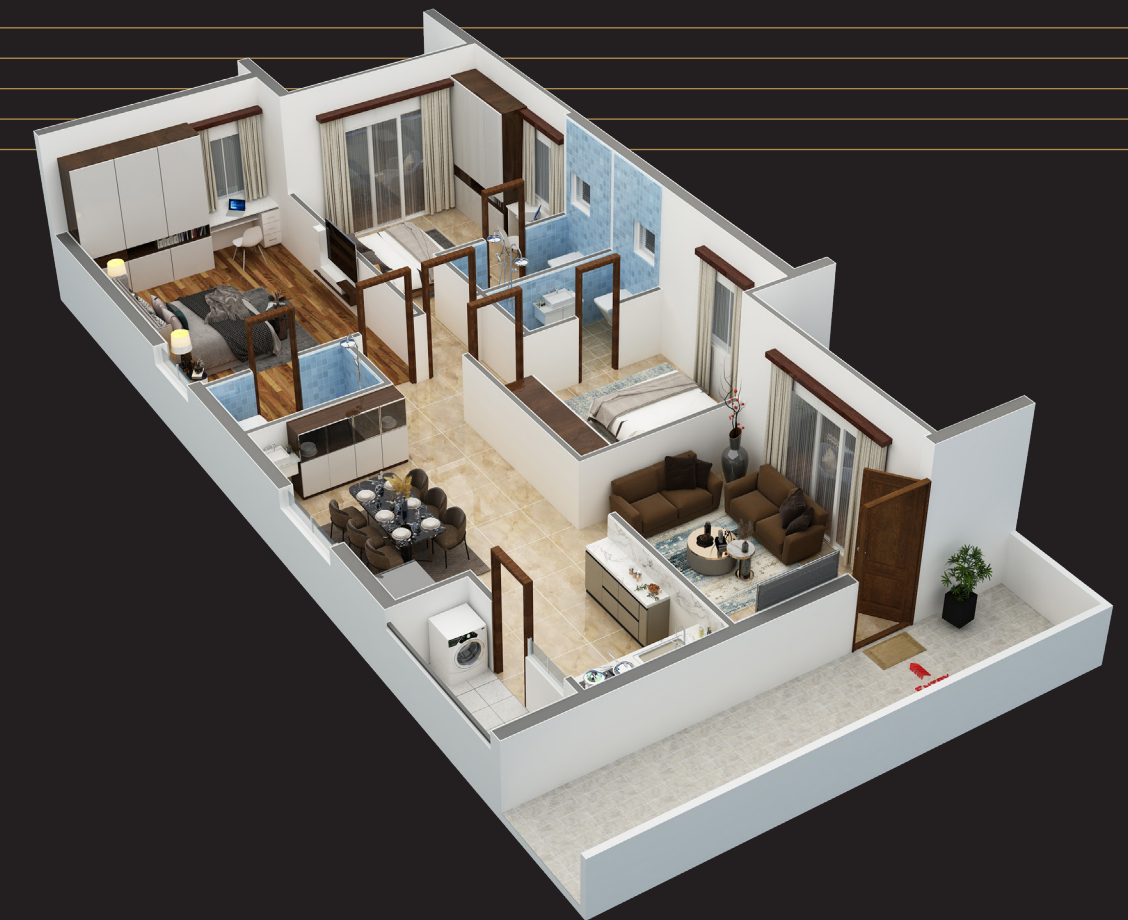
EAST VIEW 3 BHK