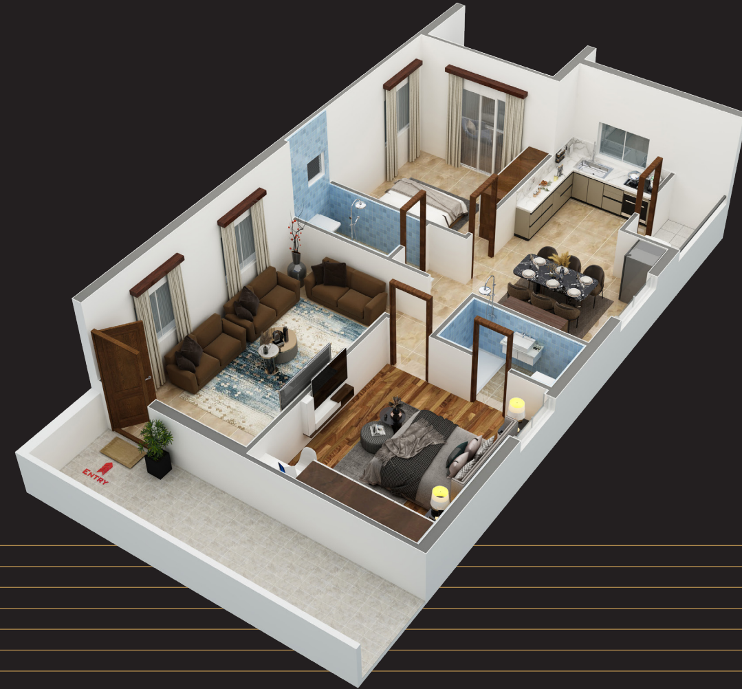
WEST VIEW 2 BHK